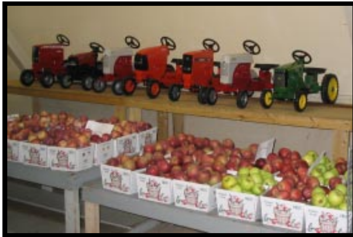
Apples and tractors...and much more - donated and auctioned off to support various prison ministries

For the 22nd year, Support for Prison Ministries , along with a network of dedicated volunteers from the Lancaster, Pennsylvania area, organized a special benefit auction to support prison ministries. It was held at the