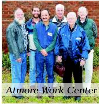
Atmore Work Center