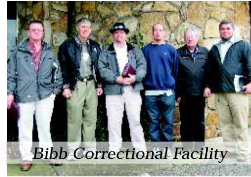
Bibb Correctional Facility