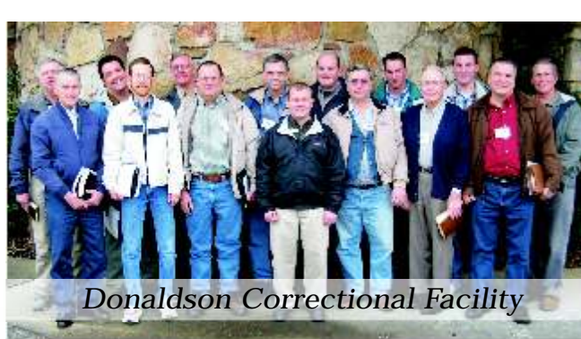
Donaldson Correctional Facility