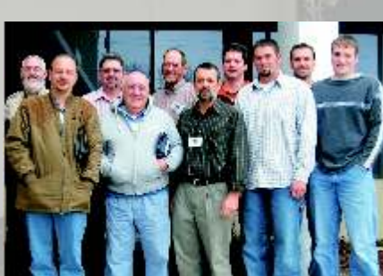
Easterling Corr. Facility