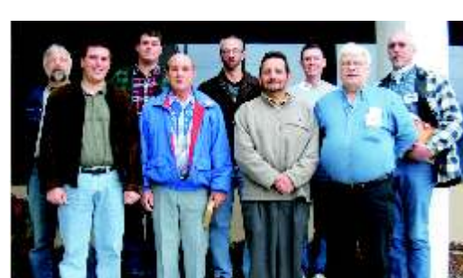
Ventress Correctional Facility

One lady had just left Health Care and was waiting for a commute down to the Annex. Since she was stuck in the Old Dining room where we were, I started chatting with her. She said she'd just found out her mammogram showed three spots. She's lost at least three members of her family to breast cancer. While we talked, another volunteer walked over and sat down with us. She listened awhile and then said, "I've had breast cancer." My mouth dropped open at that God-appointment. They talked awhile and the inmate thanked her for the inspiration as her commute arrived and she left for the Annex again.