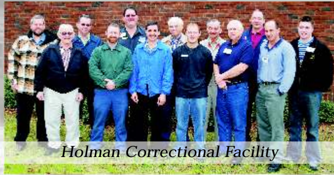
Holman Correctional Facility