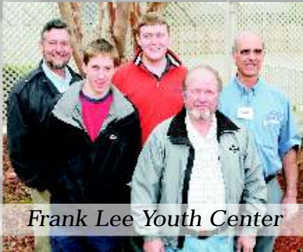
Frank Lee Youth Center