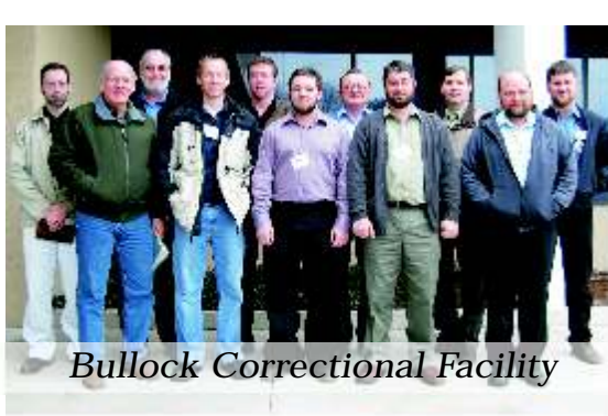
Bullock Correctional Facility