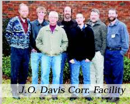
J.O. Davis Corr. Facility

opportunity to thank you val to Bibb Correctional The singing, music, and and you could feel the ing it was for me. Thanks and may God richly bless