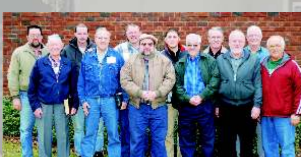
Fountain Correctional Facility