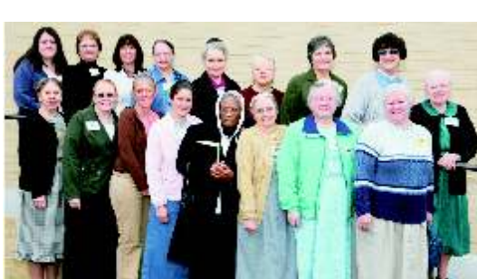
Tutwiler Prison for Women