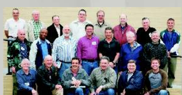
Draper Correctional Facility