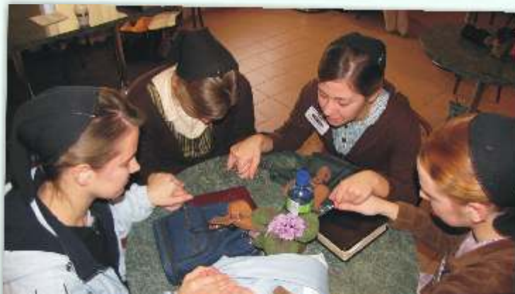
10:00 AM With a later entry time, the ladies spend extra time praying for the day ahead. The men are on their way to prison.