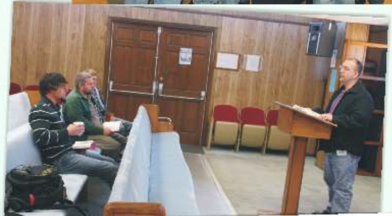
11:30 AM A short devotional, followed by instructions for the day, and the men are soon ready to exit towards the dorms.