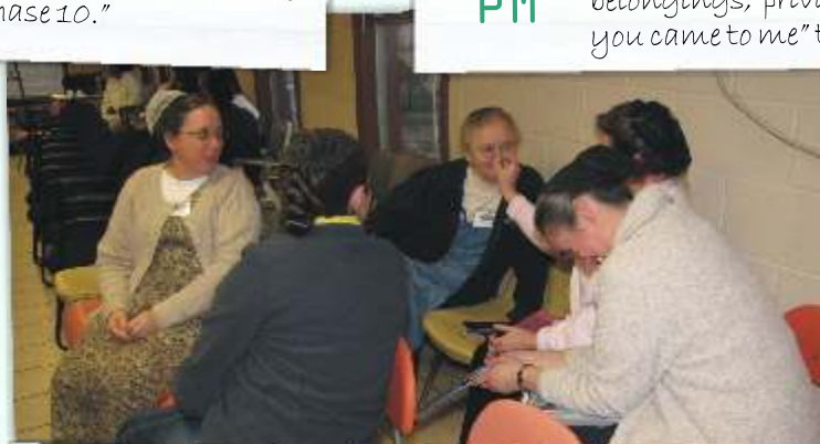
5:00 PM It has already been a long day, but a special chapel service is still to come. The ladies relax for a few moments before the evening service.