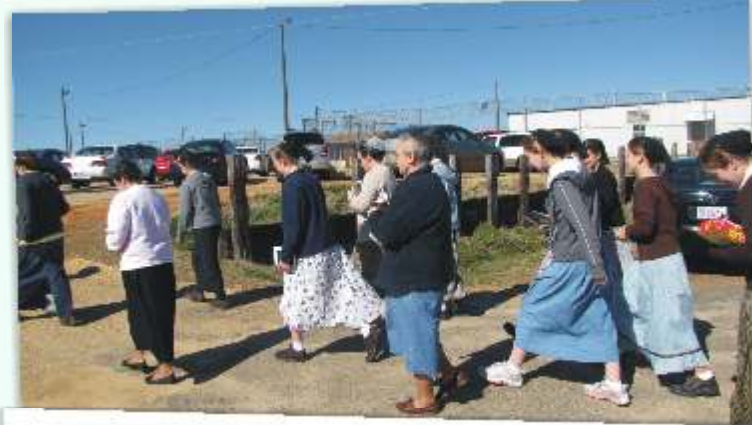
11:00 AM The time has finally arrived for interacting with the ladies at Montgomery Women's Center. Entering the prison as a group, thoughts are now focused on personal interactions inside the fence.