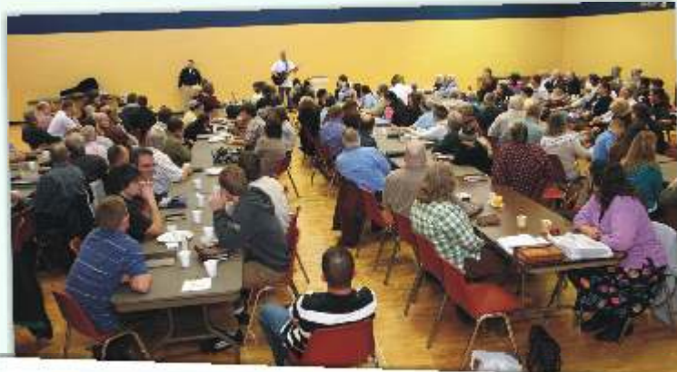
8:00 AM Joining the Montgomery region teams for a daily time of worship, sharing, and teaching.