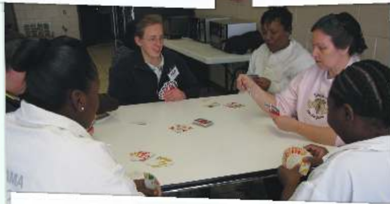
12:00 PM Friendship building can occur in a variety of ways, including "Phase 10."