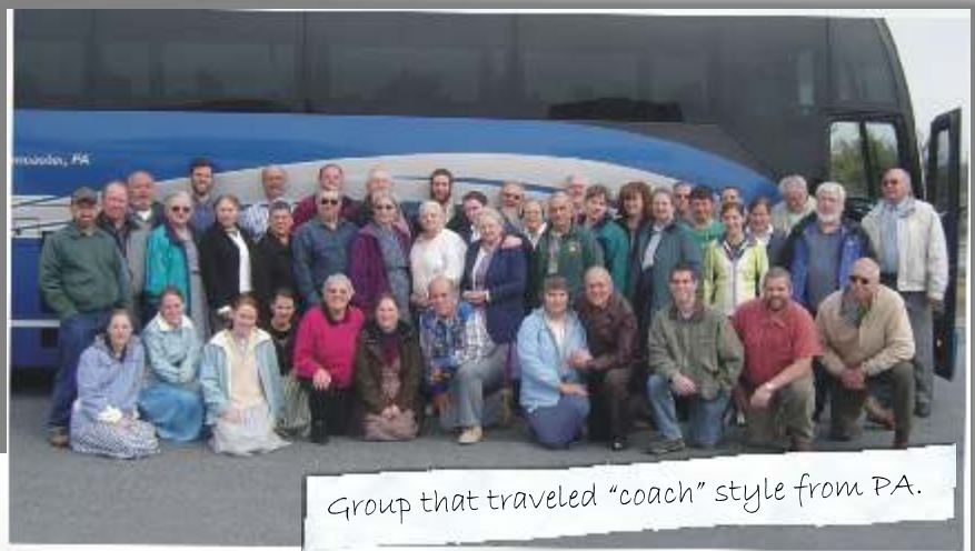
Group that traveled "coach" style from PA.